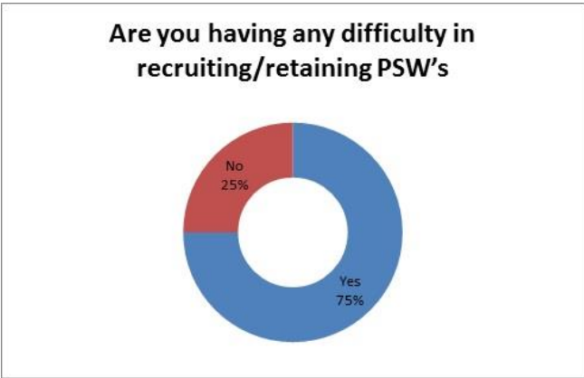
Breakdown by LHIN: